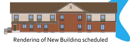
Rendering of New Building scheduled to be completed in the winter of 2023 This is a 19 bed shelter