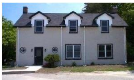
A Place Called Home – former facility front and back