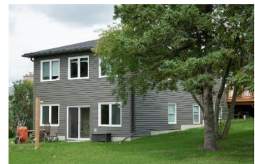
Haley House – Reintegration Housing