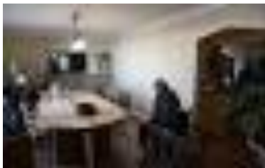
Accessible Community Living